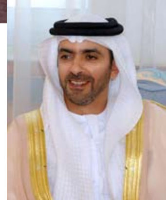
H.H. Major General Sheik Saif bin Al Nahyan, Deputy Prime Minister and Minister of Interior of the UAE