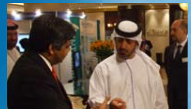
H.E. the Minister of Presidential Affairs of the United Arab Emirates visits the 2009 exhibition