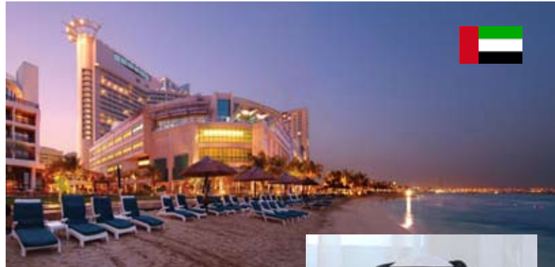
Beach Rotana Hotel

You are invited to attend the sixth Transportation Security Forum to discuss how to improve the performance of front-end and back-end processes in transportation hubs with the objective of increasing security while facilitating travel.